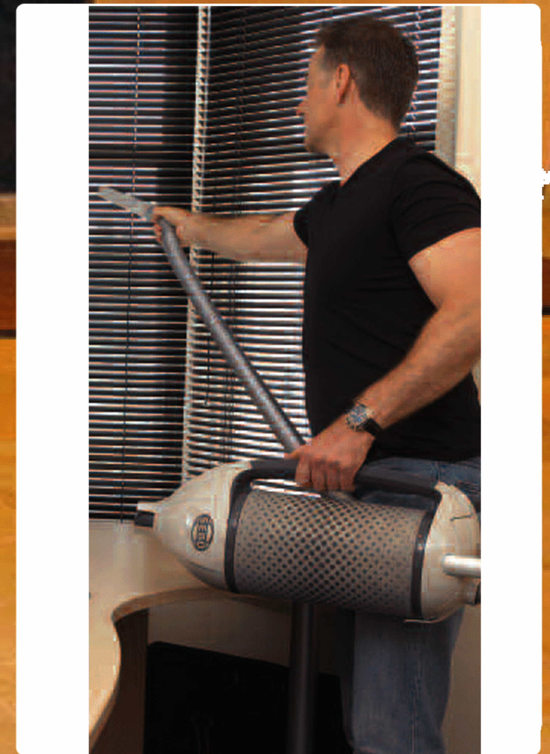
Above The Floor