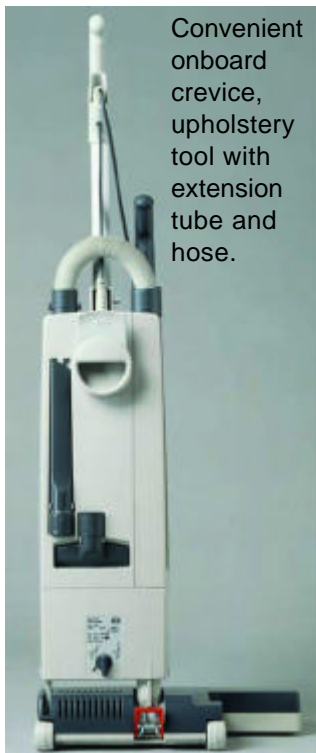
Convenient onboard crevice, upholstery tool with extension tube and hose.