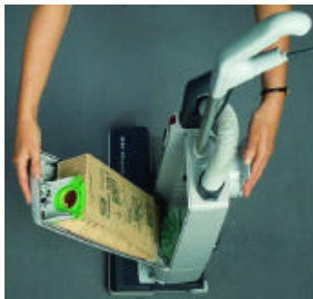
Front loading sealable paper bag for easy disposal