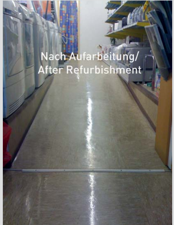
After use of GREEN Floor Pad