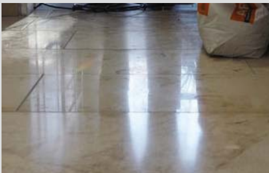
After use of GREEN Floor Pad