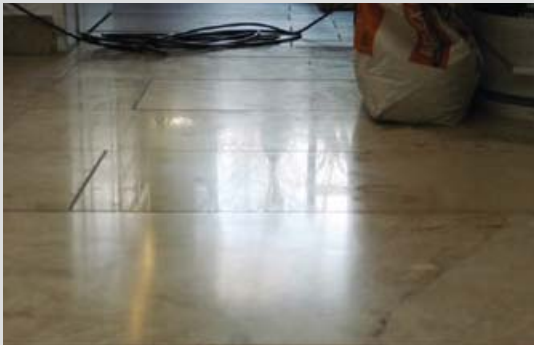
After use of RED Floor Pad